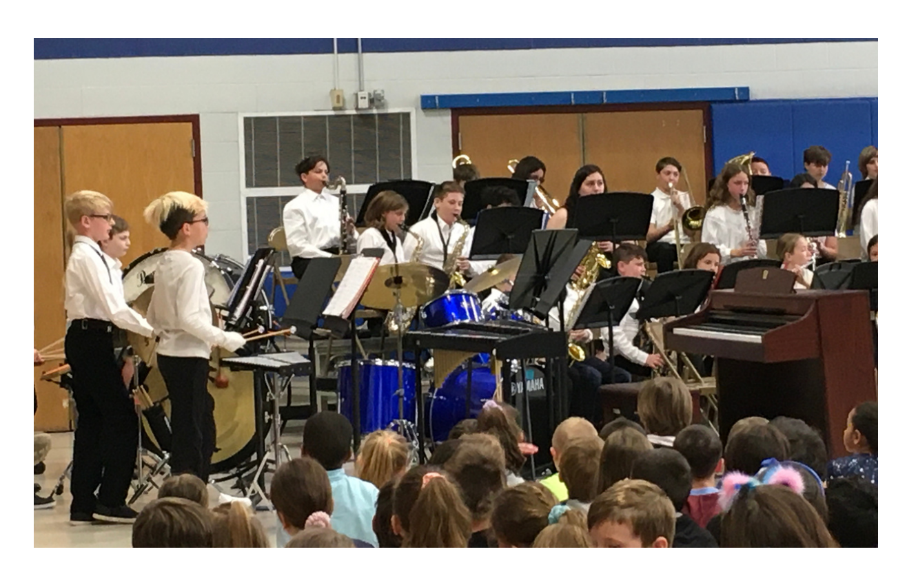
Griswold Band Students perform their annual Spring Band Concert.