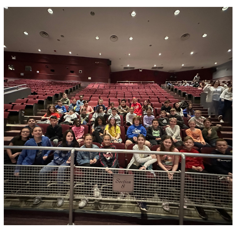
Elementary students enjoyed a field trip to CCSU to watch the annual Young People's Concert performed by the New Britain Symphony Orchestra.